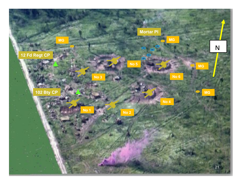
Aerial photograph showing state of 102 and Mortars at of last light 12 May

The photograph of the 102 Battery position below has been rendered from a photograph taken by then Gunner Ross Alexander on the 13 May 1968. It shows the gun and mortar position as it was at last light on 12 May 1968.