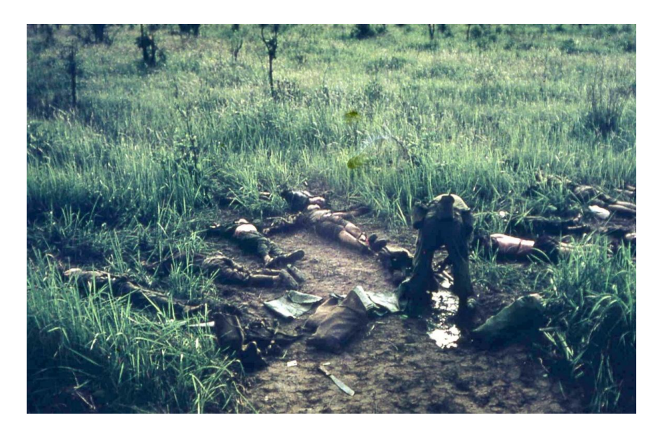
NVA dead in front of the 102 guns

As the Australians began to recover and count the cost it was revealed that nine Australians had been killed and twenty eight wounded. Jensen's Mortar Line bore the brunt of the casualties with five dead and eight wounded out of eighteen men. Two Gunners were dead and four wounded. Fifty two NVA dead lay strewn around the guns and mortars and one NVA soldier was taken prisoner. Two of Jensen's mortars were damaged and one 105 mm Howitzer was damaged beyond immediate repair and had to be flown out, another had both tyres blown out and a hole in its trail but the gun stayed in action. The 102 Battery O sized bulldozer was riddled with small arms fire and also had to be back loaded. Every piece of canvas (used for ammunition bays) was shredded and all personal sleeping tents ('Hoochies') riddled with bullet and shrapnel holes.