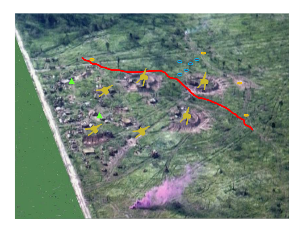
The 102 Battery, Mortar Platoon and Regimental CP positions showing the extent of the NVA penetration

Note that the three guns at the right of the photograph are pointing north while the remaining three guns are pointing east