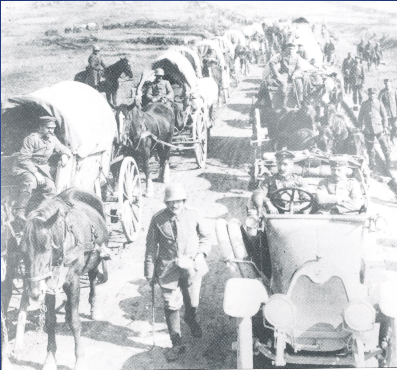
German transport – mostly horse-drawn – on the Albert–Bapaume road, March 1918.