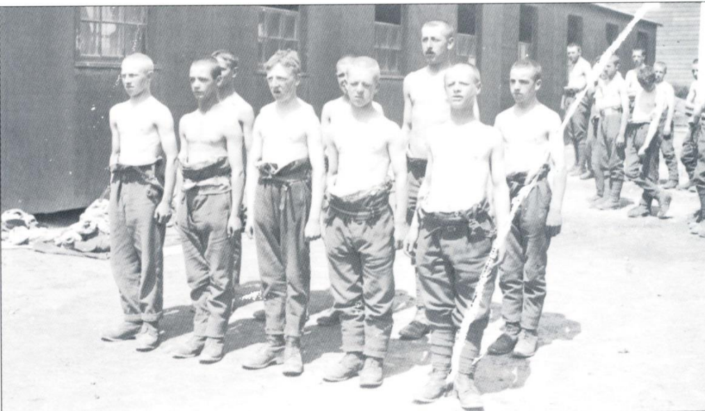
Young British conscripts photographed at the infantry base depot at Etaples in 1918.